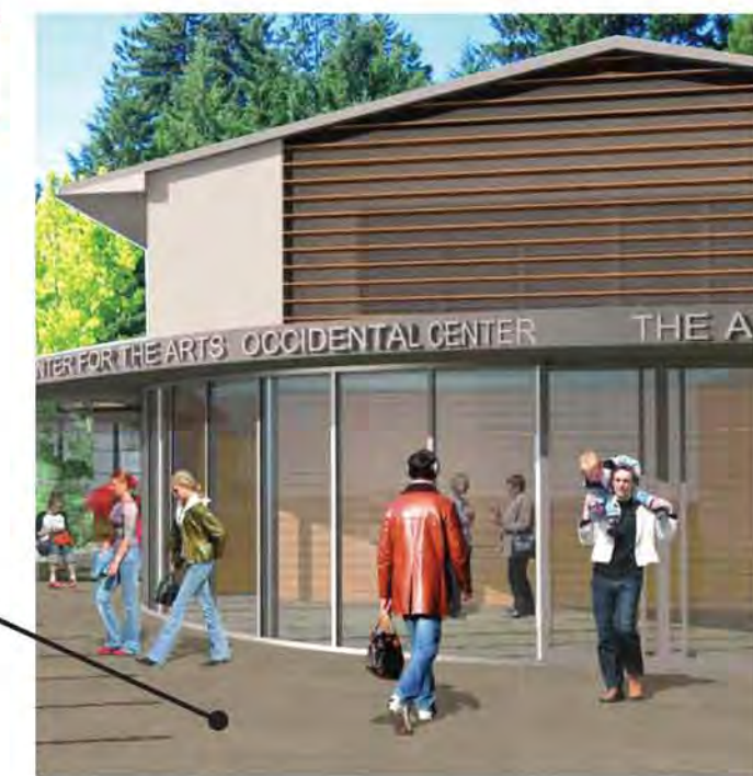
New Plaza and Lobby Entrance