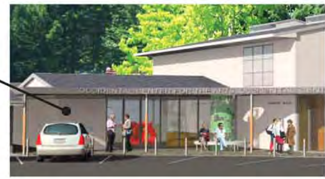
New Gallery Space, Covered Promenade and Box Office